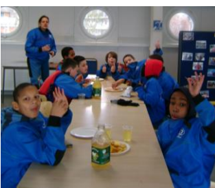
Pictures taken from the Transition Trips with the groups from Goodrich Primary School and The Charter School